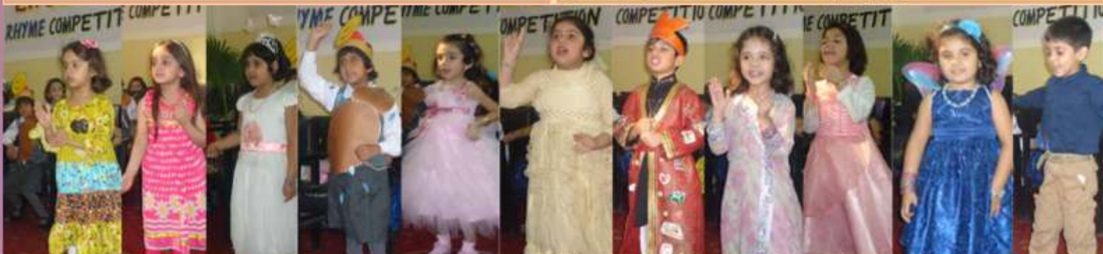
Little participants of English Rhyme Competition conducted by Nur/KG Wing Model Town