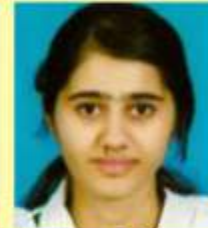
Amna Fakhar 1038