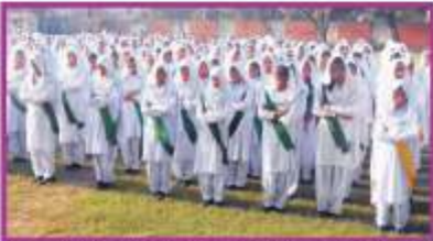
Assembly for Girl Guides Prize Distribution