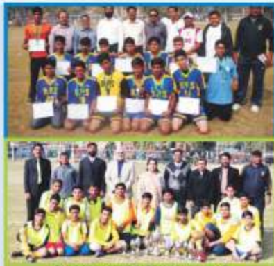
Principal DPS & winners of Interhouse Football Tournament BSW-MT

The Inter School Punjab Olympic Games 2016 were held from 1st November, 2016 to 5th November, 2016. This tournament witnessed yet another enthralling performance by the young athletes of DPS as they retained their 1st position & the Overall Trophy among 300 schools from all over the province.