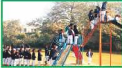
A Visit to Model Town Park