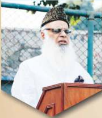
DPS Alumni The Class Of 1975