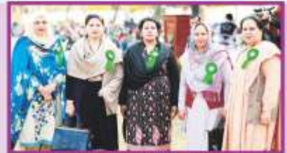
Principal with Heads of Wings