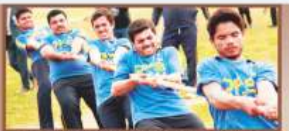
The tug of war competition at the Annual Sports Day 2017