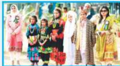
Nature Loving Day (Nature Walk)