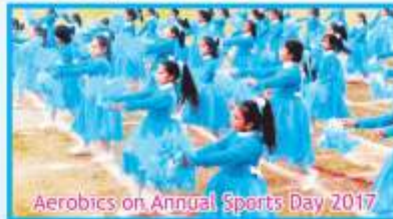
Aerobics on Annual Sports Day 2017