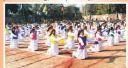
PT Display at the Girls Senior Wing, MT Sport Day, Jan. 12, 2017