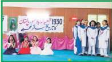
Iqbal Day Celebration 2017