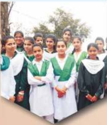
Activities in Girls Senior Wing TS