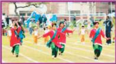
Chatti Race at the Annual Sports Day 2017