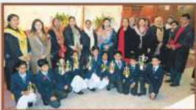
Principal DPS & winners of English Speech Contest