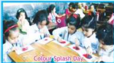
Colour Splash Day