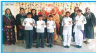
Winners of International Kangaroo Mathematics Contest, 2016