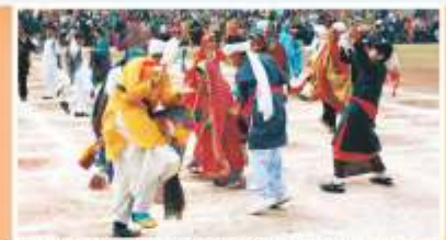
A beautiful display of provincial culture at the Boys Junior Wing, MT Sport Day, Jan. 21, 2017